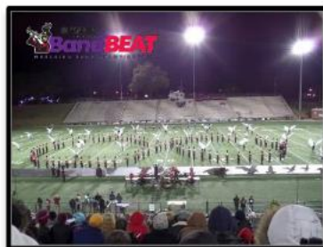
Competing in SC!