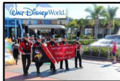
At Walt Disney World!