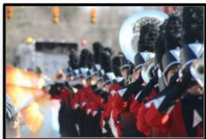
In the NW Community!